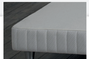
Straight edge finish